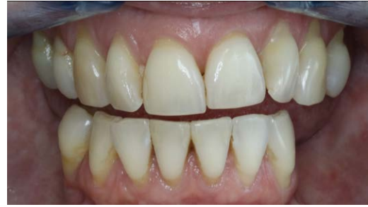
2. Initial situation