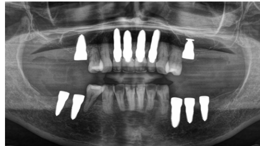
4. Surgery ALL IN ONE