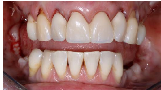
6. Long-term temporary prosthesis