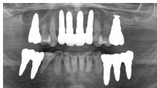
10. 3rd session / 2nd visit