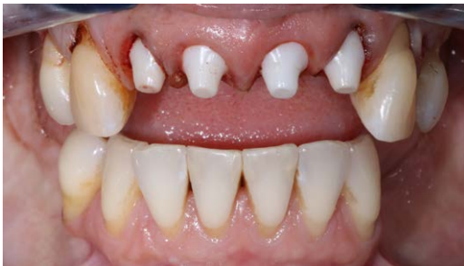
5. Directly Postoperative