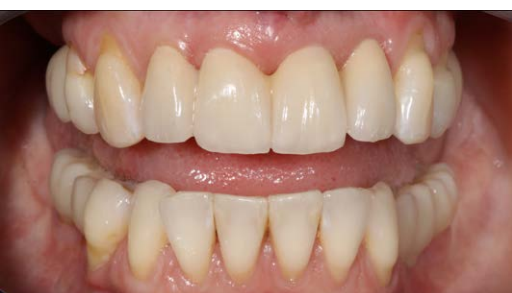
9. Final restoration