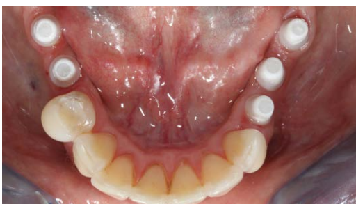
7. Four months later